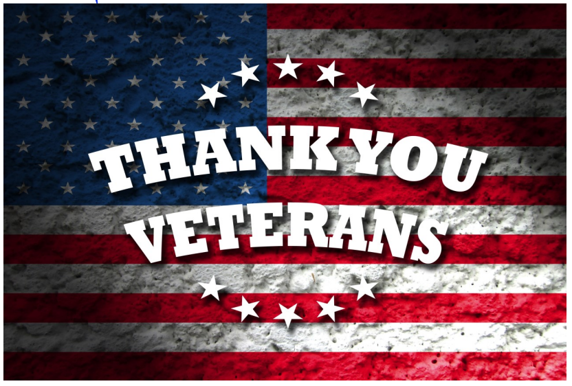
The Sumrall High School History Club will host a Veterans Breakfast, tomorrow at 7:00 a.m. in the FLC. All veterans are invited!